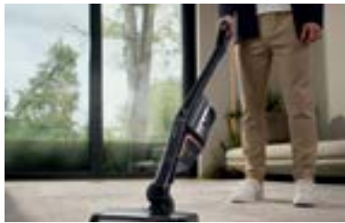
11" Wide XXL Electrobrush

These cordless stick vacuum cleaners are ready to use in an instant. With no cord, they offer maximum flexibility while a high-capacity rechargeable battery means they can clean large areas without interruption.