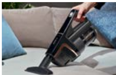
3 included cleaning accessories