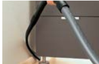
Flexible Crevice Nozzle