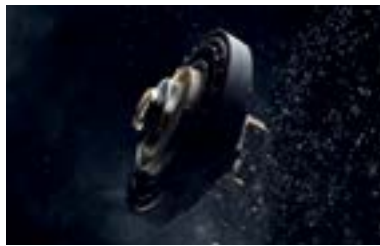
Miele-Made Digital Motor