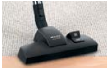
AllTeQ Combination Floorhead