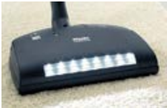
One of three optional Electro Brush Floorhead

Offering a 5-year manufacturer's warranty on parts and labor for most models, the HomeCare line has Miele's most comprehensive warranty package! Plus, all HomeCare Vacuums have earned the Good Housekeeping Seal. Miele HomeCare vacuums also feature additional accessories and tools just for your needs.